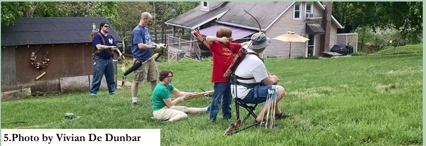
5.

Practices may be announced If there is particularly good weather.