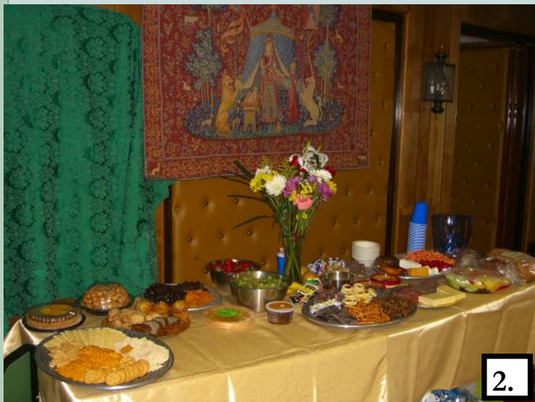
Mudthaw 2008, multiple Royal Rooms