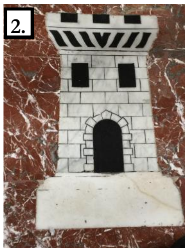
Tower Design on the Floor of the Cathedral in Sicily