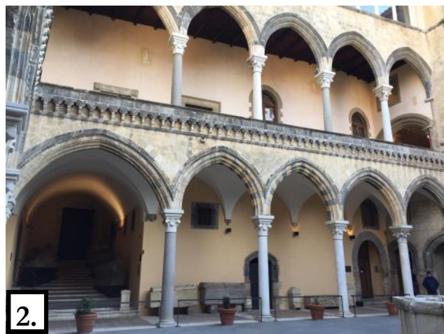
Pope's Summer Residence in Tarquinia, Italy